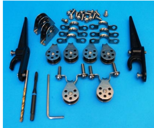
OH Lazy Jack kit - article no. 830003

For mounting you only need a knife, a lighter and a drilling/screw machine.